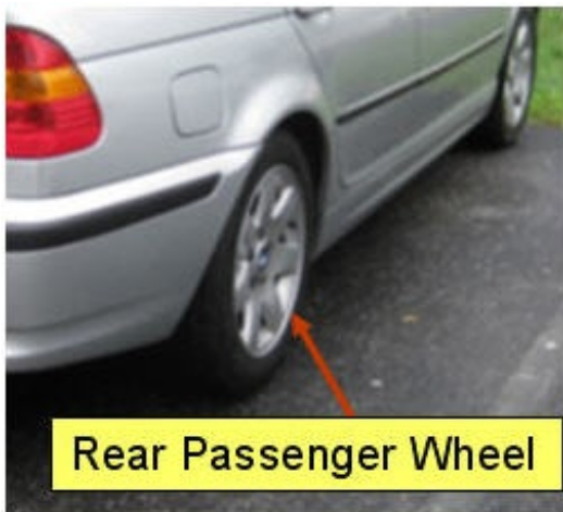
Rear Passenger Wheel